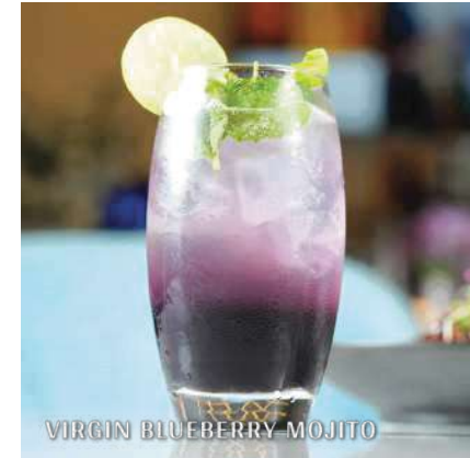
VIRGIN BLUEBERRY MOJITO