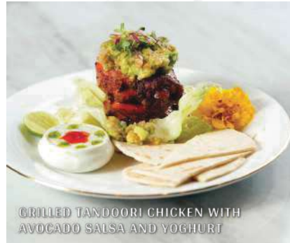
GRILLED TANDOORI CHICKEN WITH AVOCADO SALSA AND YOGHURT