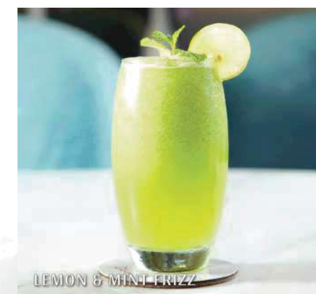
LEMON & MINT FRIZZ