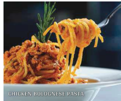
CHICKEN BOLOGNESE PASTA